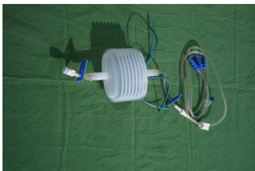
ATS-Autotrans – Autotransfusion Set