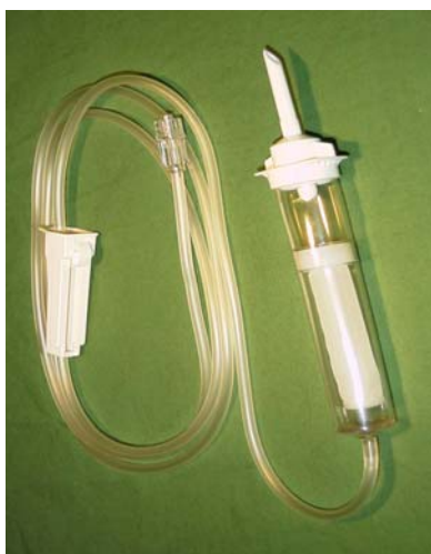
ATS 40 – Transfusion Set with 40µ-Filter